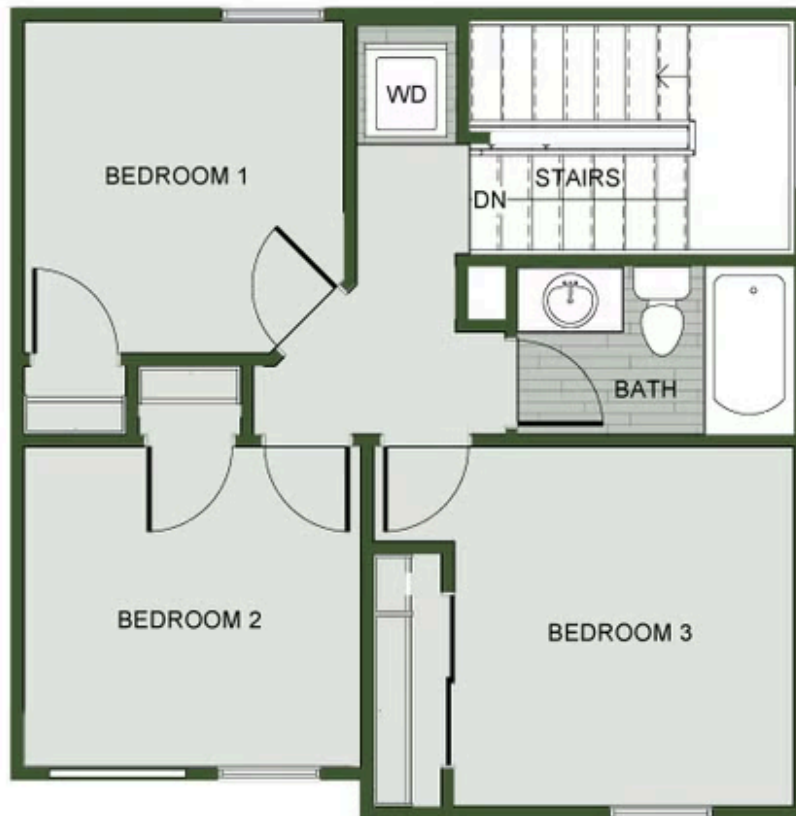
2ND FLOOR - 3 BEDROOM OPTION