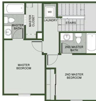
2ND FLOOR - 2ND MASTER OPTION