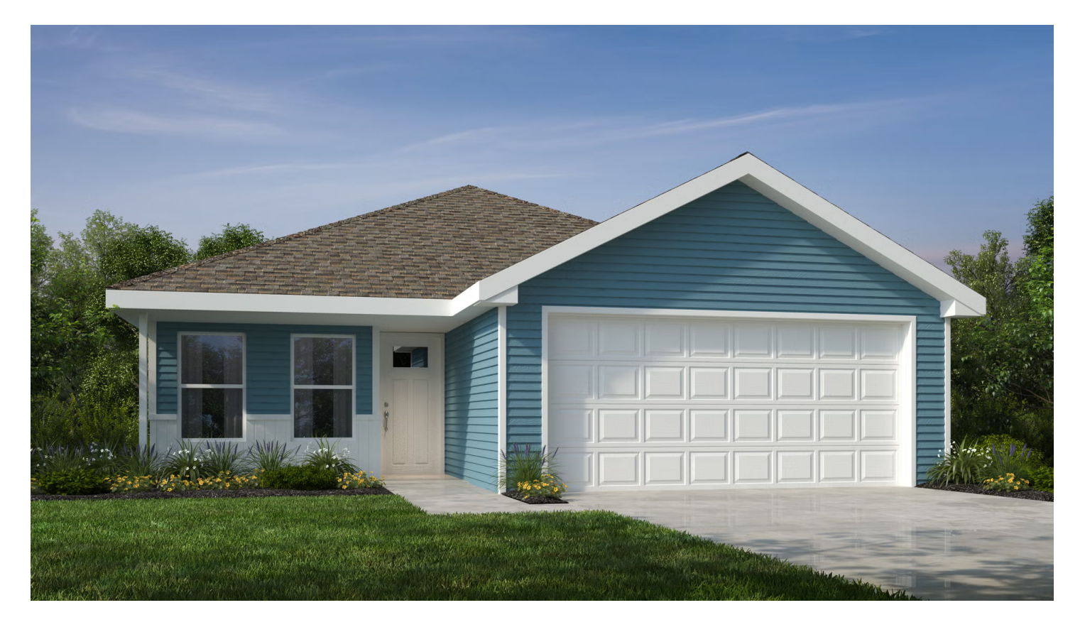
□ 3 🖺 2 🗗 2 🗀 1,165 FT<sup>2</sup>