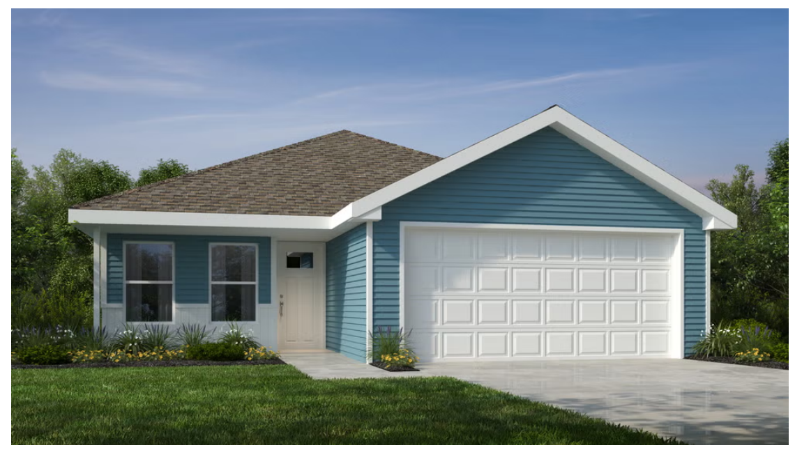
NEW LADY 5