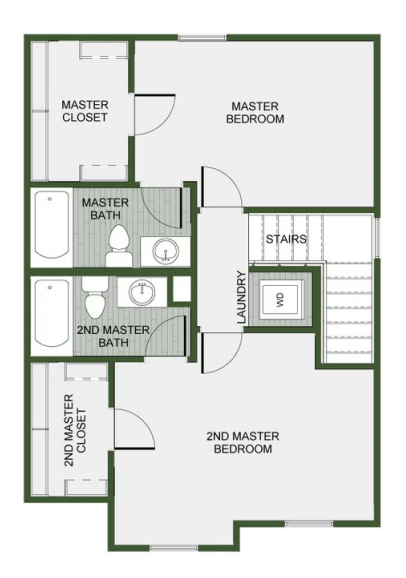
2ND FLOOR - 2ND MASTER OPTION

Monday - Saturday: 10 am-6pm 417-952-0369 schubermitchell.com