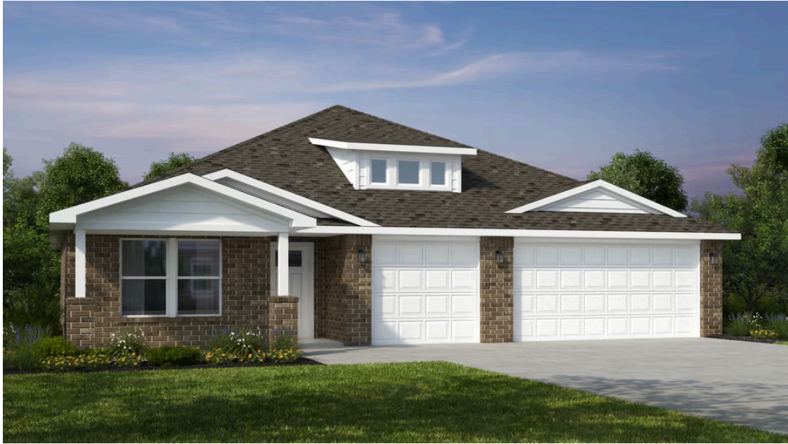
NEW LADY 3