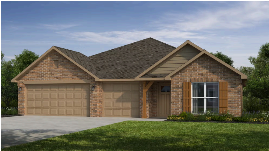
NEW LADY 4