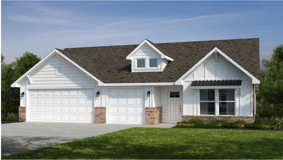
NEW LADY 1