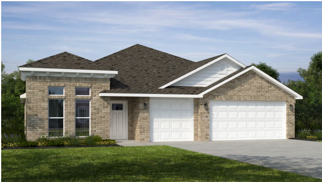
NEW LADY 2