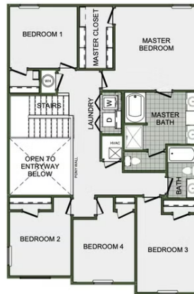
2ND FLOOR - 5 BED OPTION