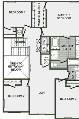
2ND FLOOR - LOFT OPTION