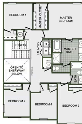
2ND FLOOR - 5 BED OPTION