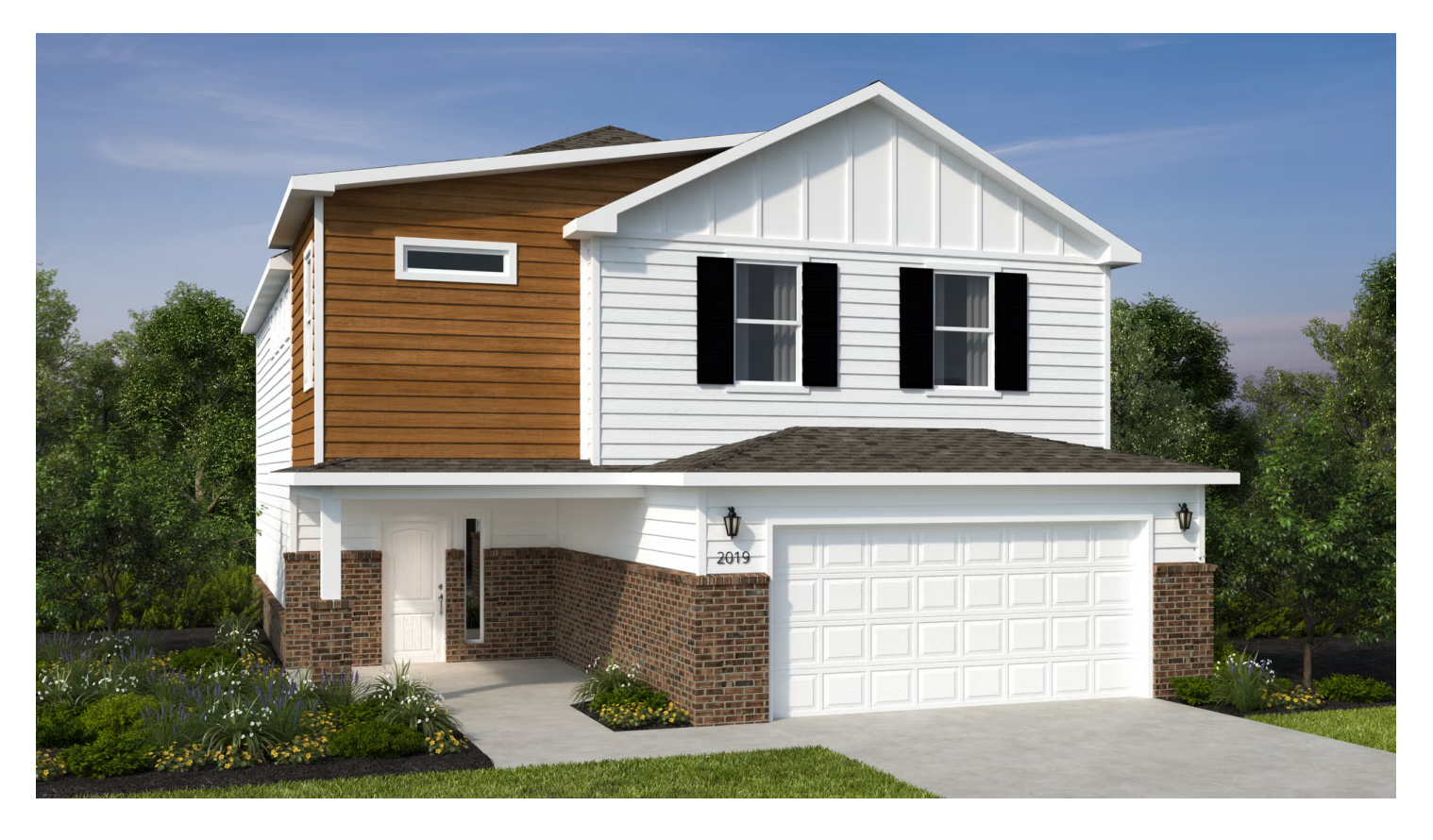
\implies 4 - 5 \stackrel{c}{\vdash} 2.5 - 3 \stackrel{c}{\rightharpoonup} 2 \stackrel{c}{\leftrightharpoons} 2,552 FT<sup>2</sup>