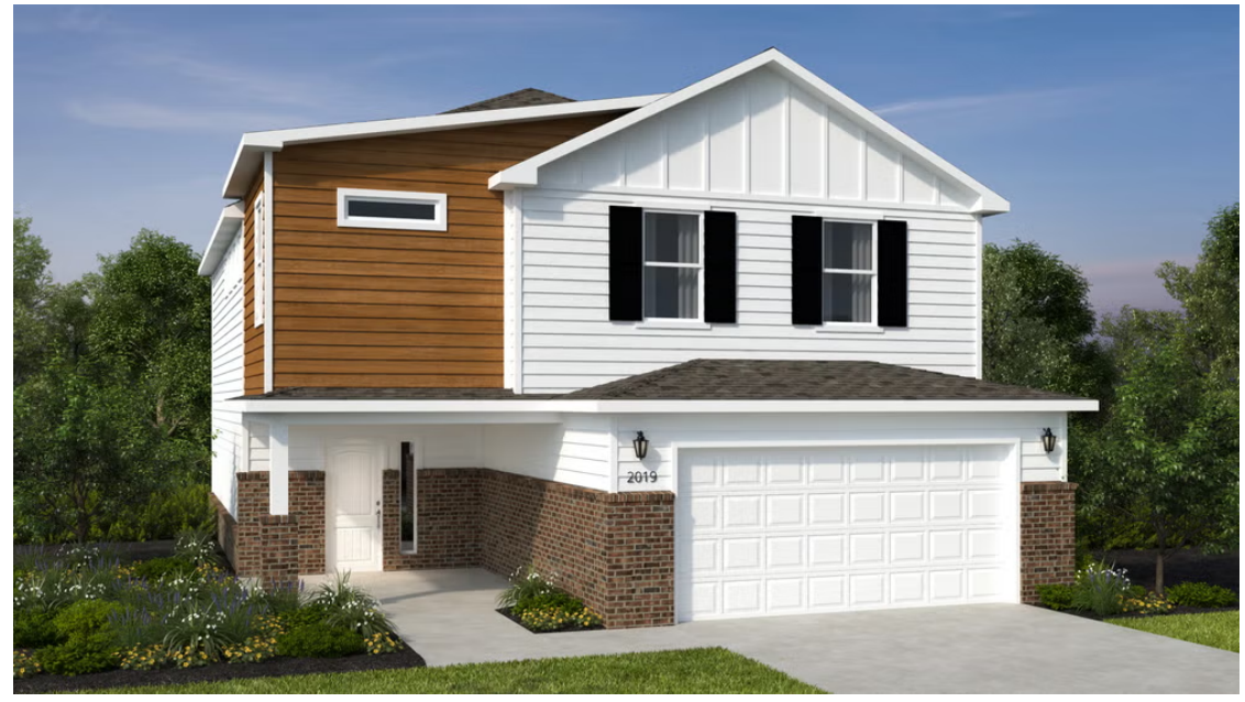
NEW LADY 1