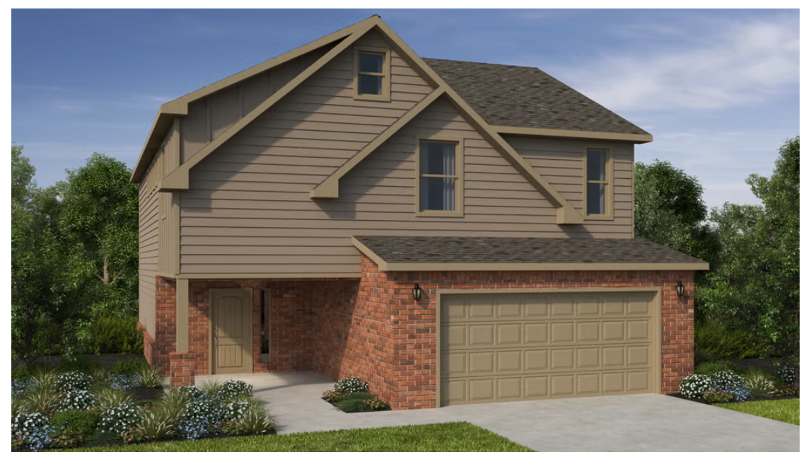
NEW LADY 3