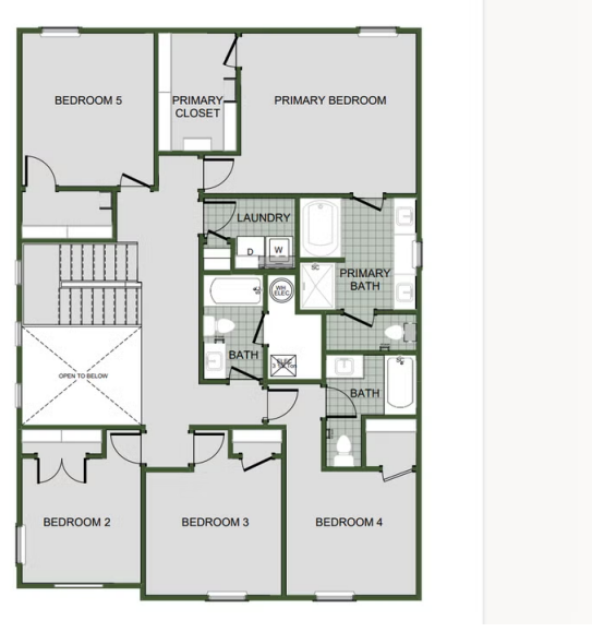
5TH BEDROOM OPTION