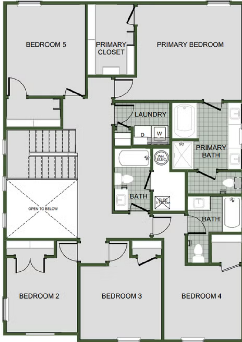
5TH BEDROOM OPTION