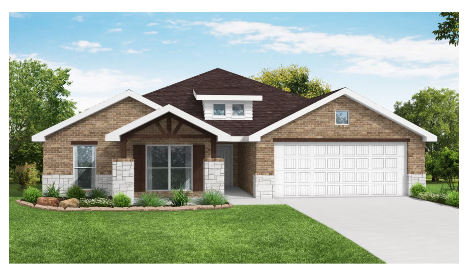
STARTING AT $426,000 = 4 = 3 = 2 = 2,410 \text{ FT}^2

The 2410 series is a 4 bed, 3 bath, 2410 square feet home with a large family, dining, and kitchen area with a bar-style counter ideal for hosting guests. An open design layout creates a welcoming space for family time. The large primary suite offers a spacious walk-in closet, double bathroom vanities, and a separate tub and shower.