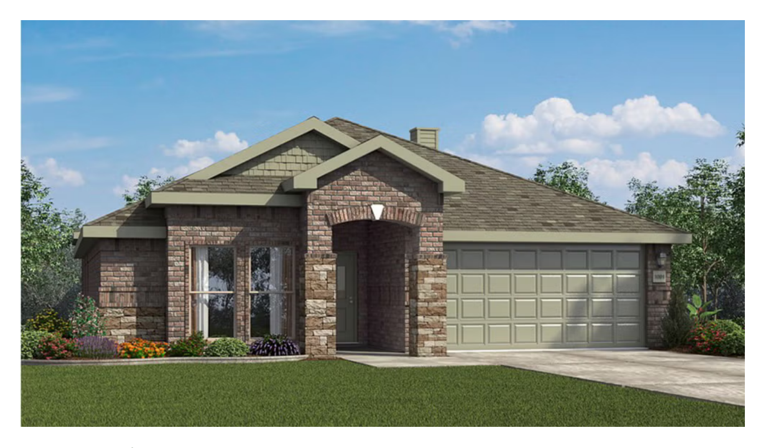
STARTING AT \$348,000 = 3 = 2 = 2,050 \text{ FT}^2