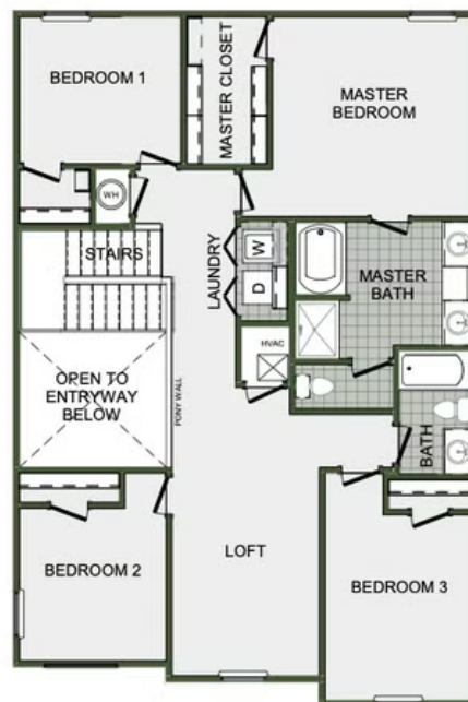
2ND FLOOR - LOFT OPTION