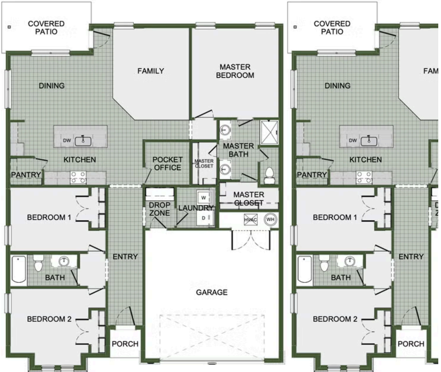
POCKET OFFICE OPTION