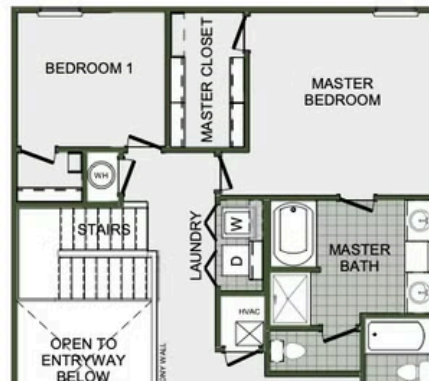
2ND FLOOR - LOFT OPTION