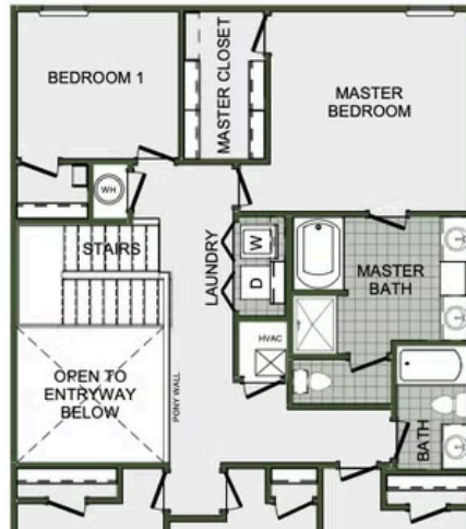
2ND FLOOR - 5 BED OPTION