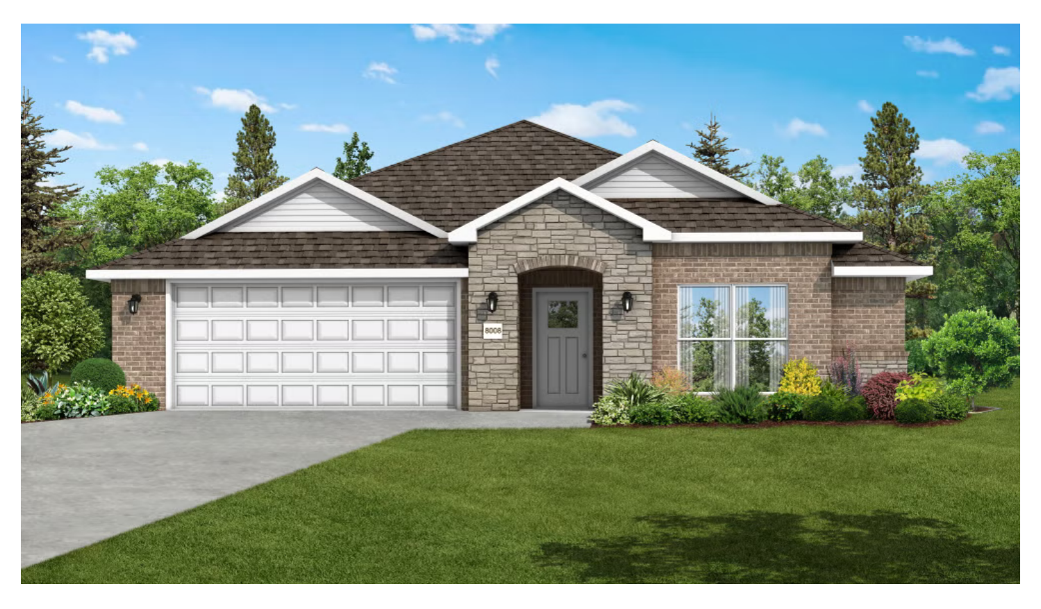
PRICED AT \$377,644 \implies 3 \implies 2.0 \implies 2 \implies 1726 \text{ FT}^2