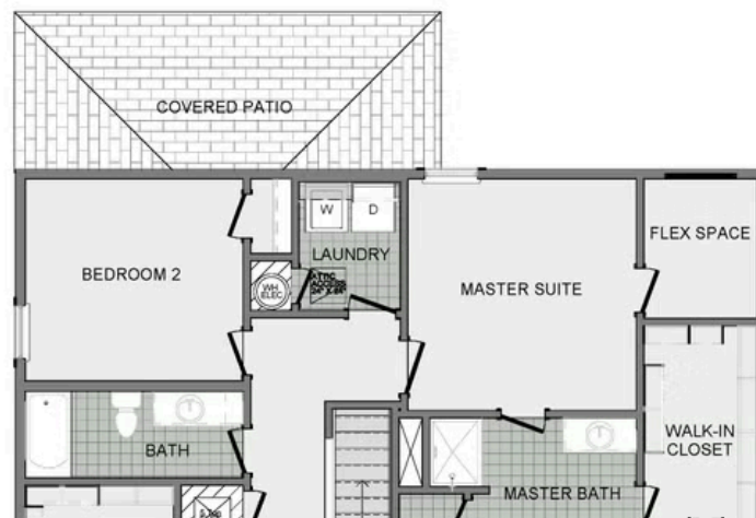
2ND FLOOR - 4 BED OPTION