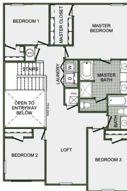
2ND FLOOR - LOFT OPTION