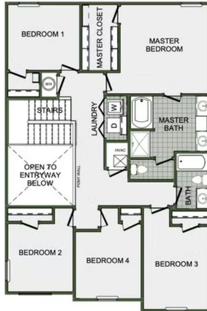
2ND FLOOR - 5 BED OPTION