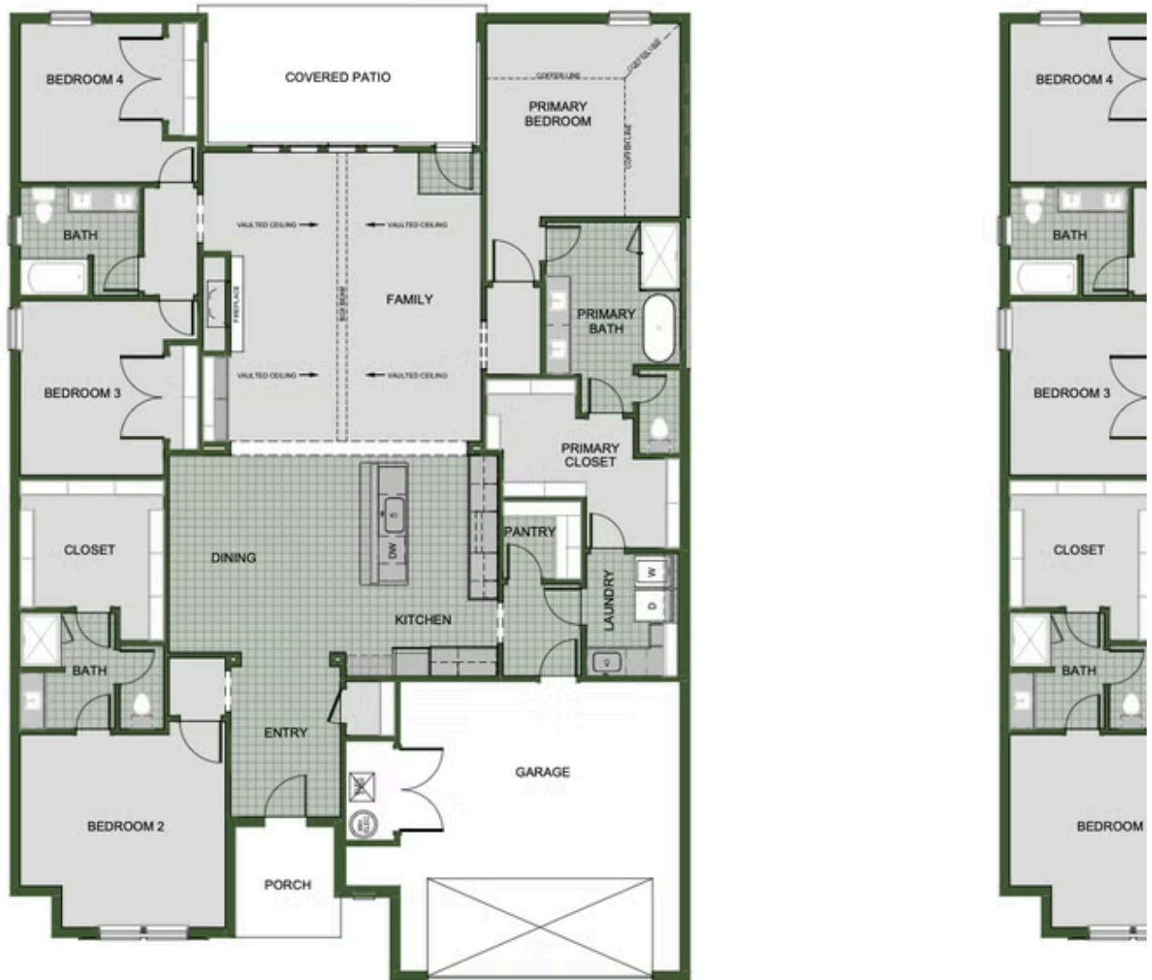
2ND MASTER SUITE