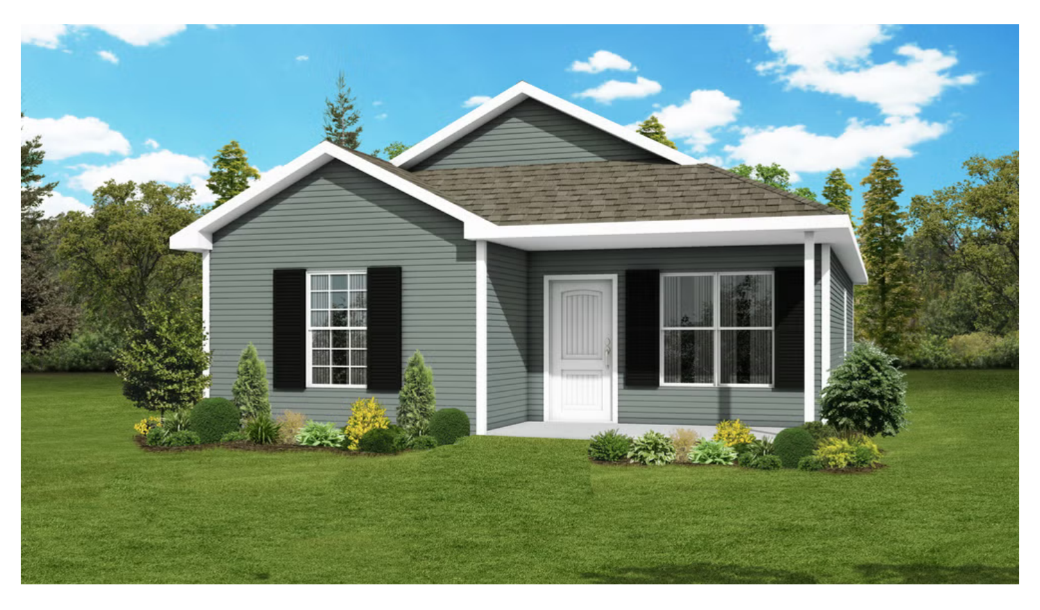
priced at $200,432 = 2 = 2.0 = 1060 \text{ FT}^2

The 1050 Cottage offers a beautiful wide-open kitchen and living space. Gather around the spacious kitchen with friends and family. Enjoy the privacy of a secluded master suite and a sizable walk-in closet. This plan is the definition of affordable luxury, with a modern design that suits a busy and active lifestyle.